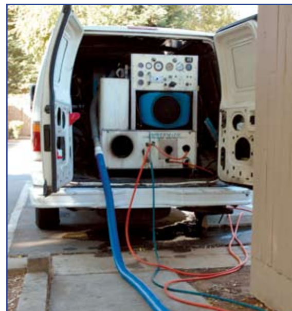
A professional vacuum system collecting wash water.

All carpet cleaners who conduct cleaning operations, which generate wash water must perform cleaning operations based on established best management practices (BMPs). With permission from the sanitary district and the property owner, wash water from