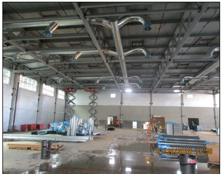
Gymnasium - Windows and HVAC installation

Storm Water Pollution Prevention Program (SWPPP): The SWPPP specialist is onsite weekly for monitoring. Monitoring is very active during wet weather.