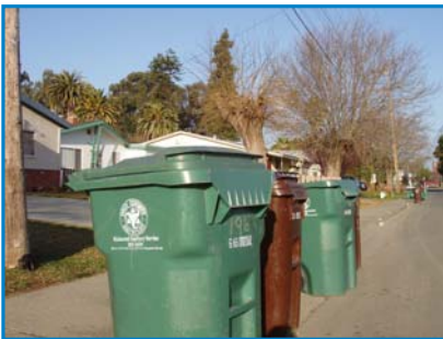
Richmond Sanitary Service provides weekly solid waste and recycling collection to Pinole.

Solid waste from Pinole is transported to the Portero Hills Landfill in Suisun City in Solano County (25 miles away) for disposal. The WCCIWMA has a contract with Portero Hills Landfill through 2014, at which point the contract will be renegotiated. The estimated remaining capacity of Portero Hills Landfill is 38.1%.