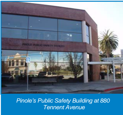
Pinole's Public Safety Building at 880 Tennent Avenue