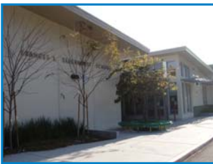
Ellerhorst Elementary School in Pinole.

Pinole will continue to encourage the location and growth of health-related facilities within the city. Pinole will also take advantage of opportunities to reuse the existing Doctors Hospital site for medical purposes when considering redevelopment options for this site.